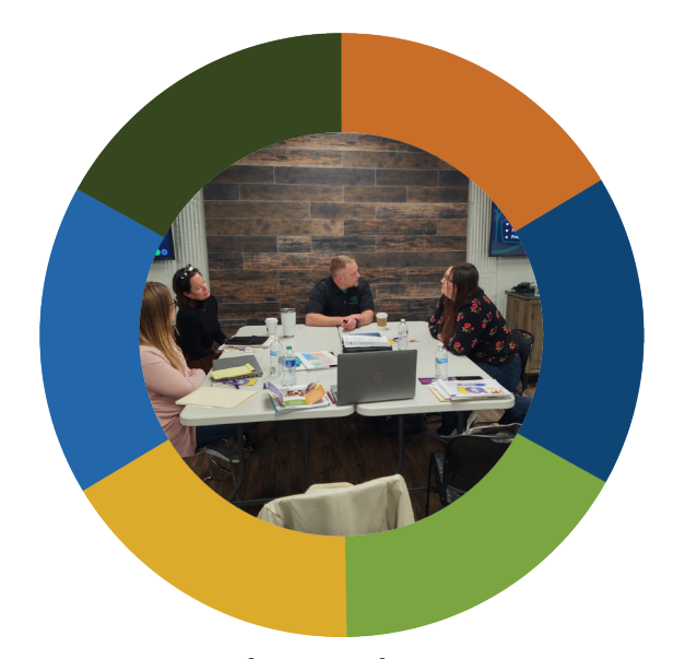
ANNUAL REPORT | FY 2022 | NETWORK KANSAS PAGE 4