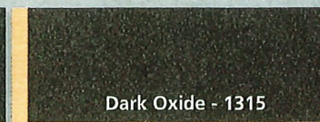
Dark Oxide - 1315