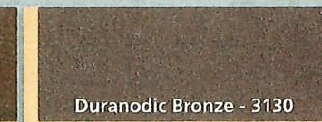
Duranodic Bronze - 3130

Plaque edge color is same as background.