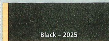
Black - 2025