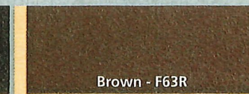
Brown - F63R