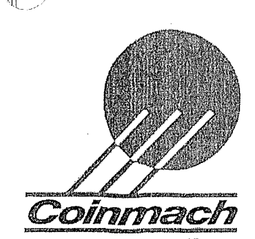
Keeping America Clean One Laundry Room At A Time