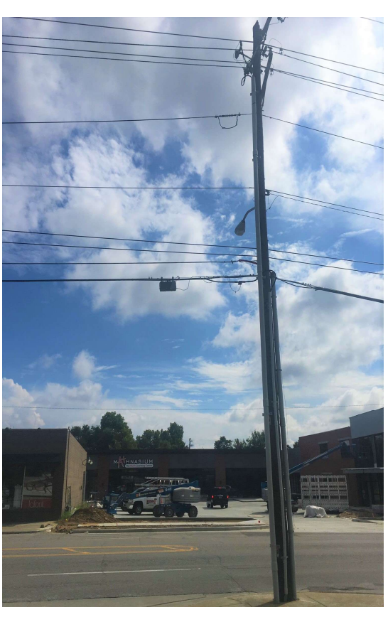
Micro Wireless Near Business Centers