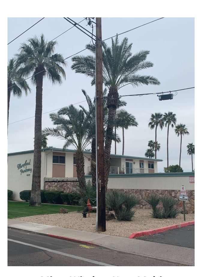
Micro Wireless Near Multi Dwelling Unit