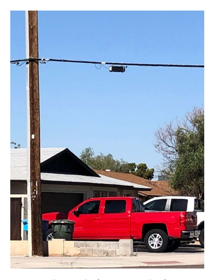
Micro Wireless Near Single Family Home