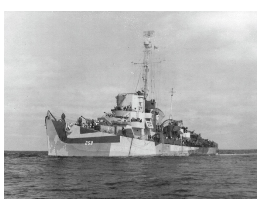
Walter S Brown (DE-258)